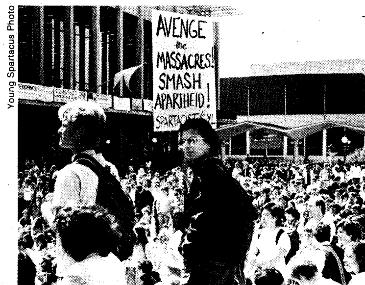
Hundreds rallied against apartheid butchery and UC cop rampage at "Charter Day" protest, March 22.