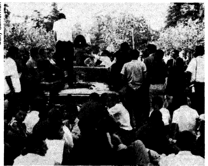
Berkeley 1964: Free Speech Movement protesters surround cop car holding arrested civil rights worker; turn it into podium for 32-hour-long rally.