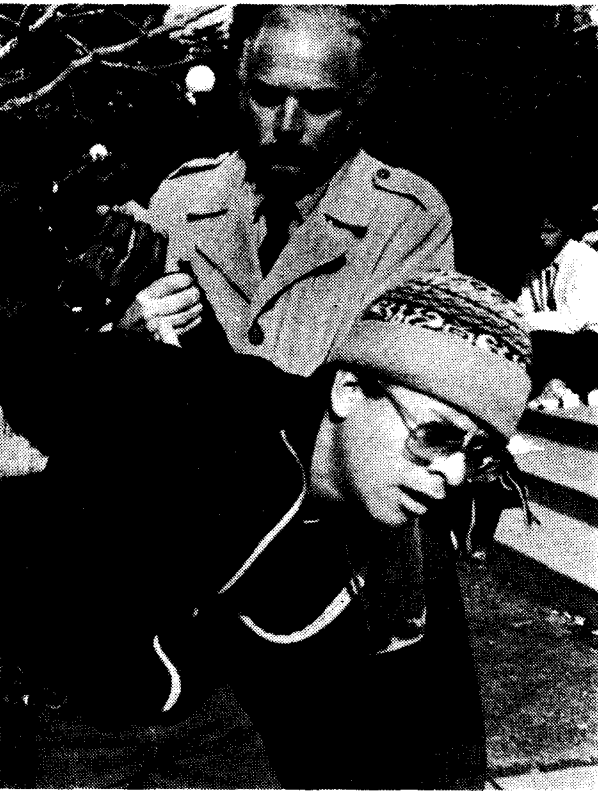
the protest in "hammer lock"—breaking his arm.