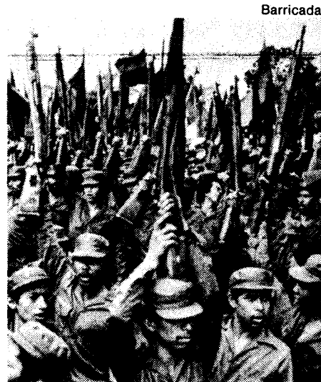
Nicaraguans prepare to fight U.S. war moves.

I ask everyone here for their support in beating this frame-up. The label